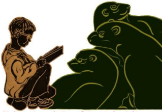
Friends of the Olympia Library