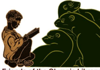
Friends of the Olympia Library