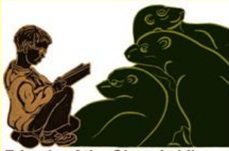
Friends of the Olympia Library