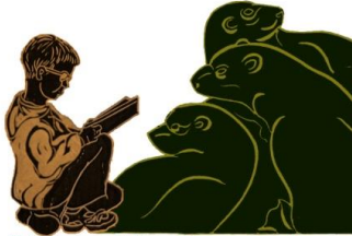
Friends of the Olympia Library