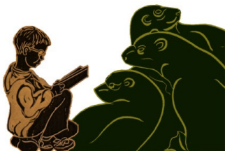
Friends of the Olympia Library