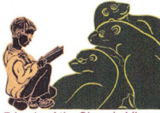
Friends of the Olympia Library