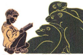
Friends of the Olympia Library