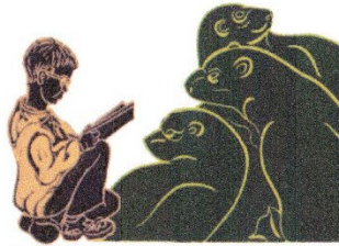
Friends of the Olympia Library