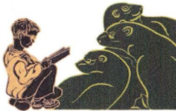
Friends of the Olympia Library