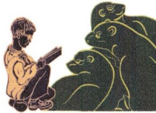
Friends of the Olympia Library