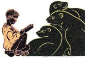
Friends of the Olympia Library

Our Mission: "To Support, promote and augment the operations of the Olympia Library."