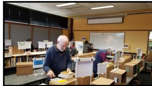
Setting up the February 2020 book sale.