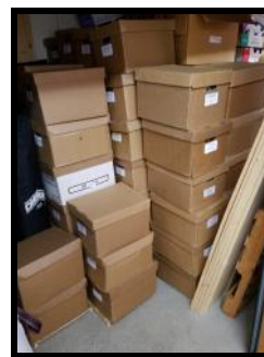
Off site storage is overflowing.