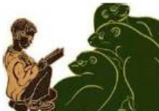
Friends of the Olympia Library